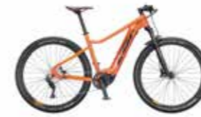
MACINA RACE 291 PT-CX5P2 DEORE 1*10