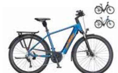
MACINA TOUR P510 PT-P5I2 DEORE 1x10