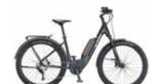
MACINA AERA P272 LFC SI-PS14 DEORE 1*10