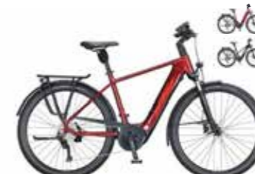
MACINA TOUR P610 PT-P6I4 DEORE 1x10