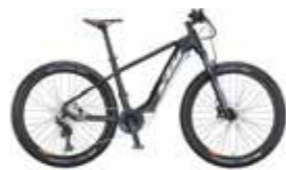
MACINA TEAM 272 PT-CX6I4 DEORE 1*11