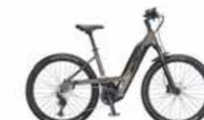
MACINA AERA 271 PT-CX6I4 DEORE 1*11