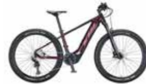
MACINA TEAM 272 GLORIOUS PT-CX6I4 DEORE 1*11