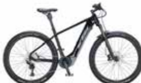
MACINA TEAM XL PT-CX6I4 DEORE 1*11