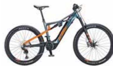
MACINA KAPOHO MASTER PT-CX6K4 DEORE XT 1*12