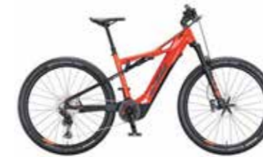
MACINA CHACANA 291 PT-CX6K6 DEORE XT 1*12