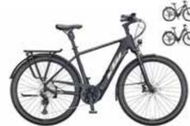
MACINA STYLE XL PT-CX6I4 DEORE 1x11