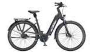
MACINA CITY P610 PT-P6I4 NEXUS 1x5