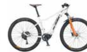
MACINA RACE 292 PT-CX5P2 ALIVIO 1*9