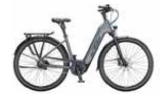
MACINA CITY XL PT-CX6I4 NEXUS 1x5