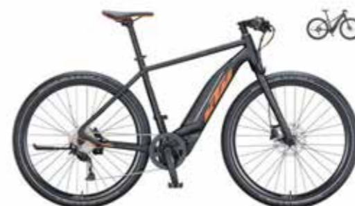
MACINA SPRINT UC-CXSP2 ALIVIO 1*9