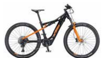
MACINA CHACANA 293 PT-CX6P4 SRAM SX 1*12