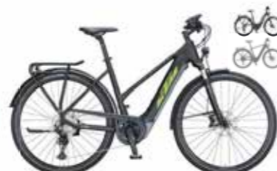
MACINA SPORT 620 PT-CX6I4 DEORE XT 1x12