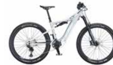
MACINA LYCAN 271 GLORIOUS PT-CX6K4 DEORE XT 1*12