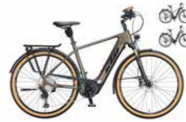
MACINA STYLE 610 NYON PT-CX6N4 DEORE XT 1x12