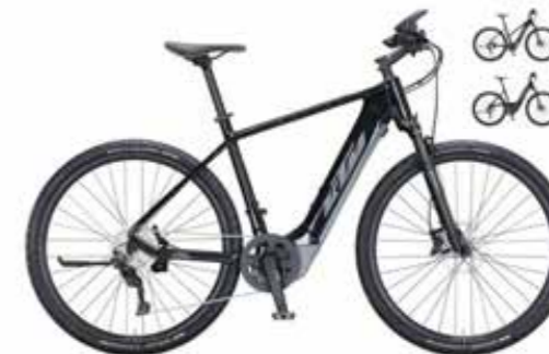
MACINA CROSS 620 PT-CX6I4 DEORE 1*10