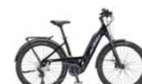
MACINA AERA 271 LFC PT-CX6I4 DEORE 1*11