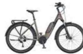
MACINA GRAN P272 SI-P5I2 ALIVIO 1x9