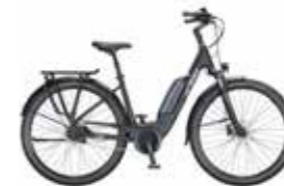
MACINA CENTRAL 5 SI-P5I2 NEXUS 1x5