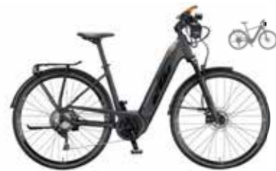
MACINA SPORT ABS PT-CX6K6 DEORE XT 1x11