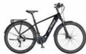
MACINA GRAN 291 PT-CX6I4 DEORE 1x10