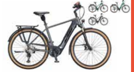
MACINA STYLE 620 PT-CX6I4 DEORE 1x11