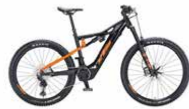
MACINA KAPOHO 2971 PT-CX6K6 DEORE XT 1*12