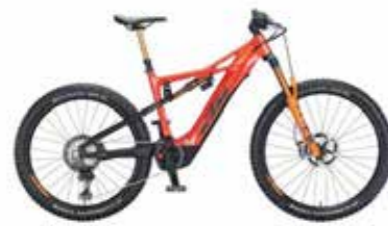
MACINA KAPOHO PRESTIGE PT-CX6K6 XTR 1*12