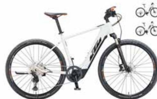
MACINA CROSS 610 PT-CX6K4 DEORE XT 1*12