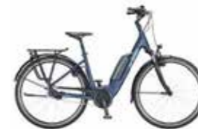
MACINA CENTRAL 7 RT SI-A4I2 NEXUS - COASTERBRAKE 1x7