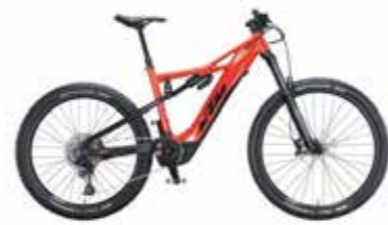
MACINA KAPOHO 2973 PT-CX6P4 SRAM SX 1*12