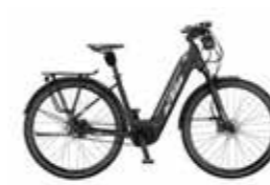
MACINA CITY 5 ABS BELT PT-CX6K6 NEXUS 1x5