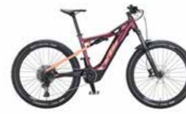
MACINA LYCAN 272 GLORIOUS PT-CX6P4 SRAM SX 1*12