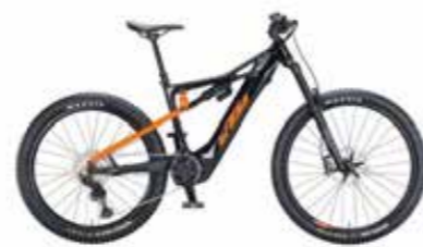
MACINA PROWLER MASTER PT-CX6K4 DEORE XT 1*12