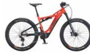
MACINA LYCAN 271 PT-CX6K4 DEORE XT 1*12