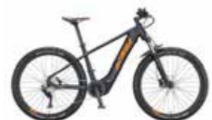
MACINA TEAM 273 PT-CX6P2 DEORE 1*10