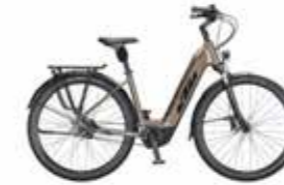
MACINA CITY 610 BELT PT-CX6I4 NEXUS 1x5