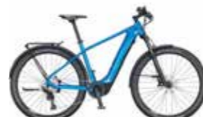
MACINA TEAM LFC PT-CX6I4 DEORE 1*11