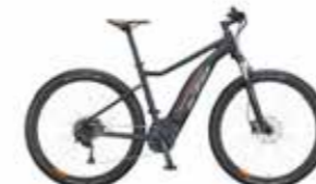
MACINA RIDE 291 UC-A+5P2 ALIVIO 1*9