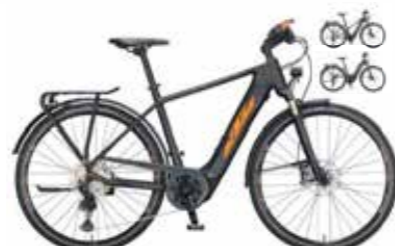
MACINA SPORT 610 PT-CX6K4 DEORE XT 1x12