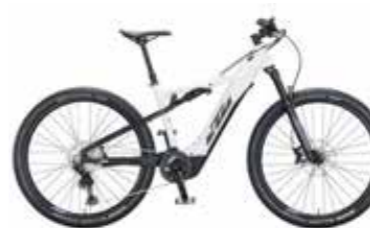
MACINA CHACANA 292 PT-CX6I4 DEORE XT 1*12