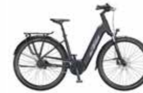
MACINA CITY A510 PT-A+5I2 NEXUS 1x5