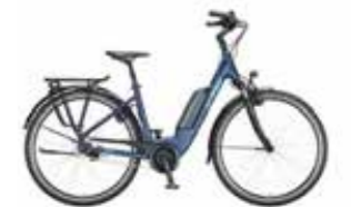
MACINA CENTRAL 7 SI-A4I2 NEXUS 1x7