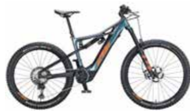
MACINA PROWLER PRESTIGE PT-CX6K4 XTR 1*12