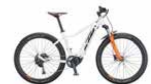
MACINA RACE 272 PT-CX5P2 ALIVIO 1*9