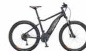
MACINA RIDE 271 UC-A+5P2 ALIVIO 1*9