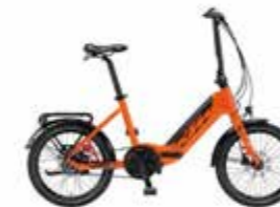
MACINA FOLD PT-A+5P4 NEXUS 1x8