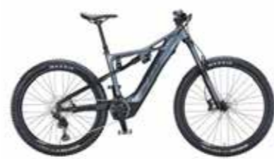
MACINA KAPOHO ELITE PT-CX6P4 DEORE XT 1*12