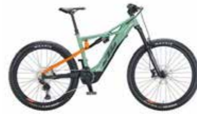
MACINA KAPOHO 2972 PT-CX6K4 DEORE XT 1*12