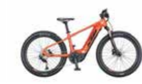
MACINA MINI ME 241 PT-A+4I2 ALIVIO 1*9