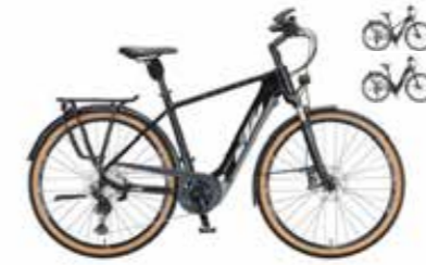
MACINA STYLE 610 PT-CX6I4 DEORE XT 1x12