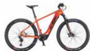
MACINA TEAM 291 PT-CX6K4 DEORE XT 1*12