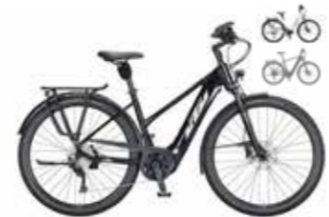
MACINA TOUR CX610 PT-CX6I4 DEORE 1x10