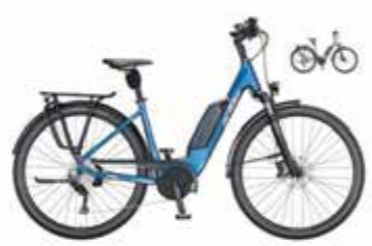
MACINA FUN P510 SI-P5I2 DEORE 1x10