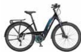
MACINA GRAN 271 PT-CX6I4 DEORE 1x10