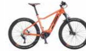
MACINA RACE 271 PT-CX5P2 DEORE 1*10