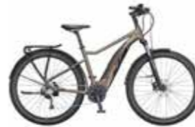
MACINA GRAN P292 UC-P5I2 ALIVIO 1x9