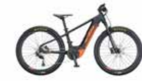
MACINA MINI ME 261 PT-PS12 ALIVIO 1*9