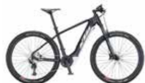
MACINA TEAM 292 PT-CX6I4 DEORE 1*11