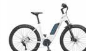
MACINA AERA P272 SI-PS14 DEORE 1*10