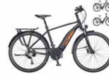
MACINA FUN A510 UC-A+SP2 ALIVIO 1x9