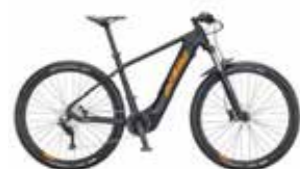
MACINA TEAM 293 PT-CX6P2 DEORE 1*10